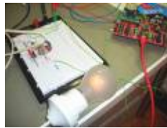
230V phase control