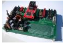
Netzer breakout board - Assembled with parts and Netzer