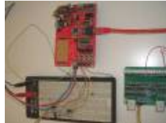
Netzer connected via S88 bus